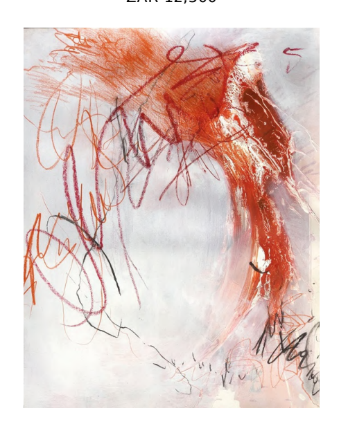
EMMA ASPELING Unity is below division, 2024 Mixed media on paper 49 x 38 cm Framed: 60 x 46 x 3.5 cm ZAR 12,500