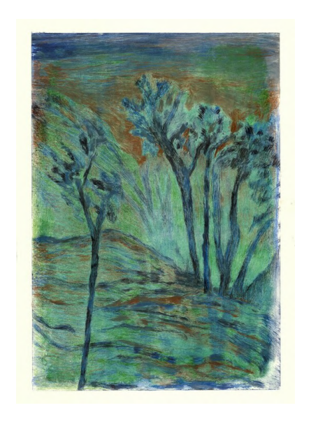
ULRICHE JANTJES Wind in the trees I, 2024 Oil-based monotype with colour pencils on Fabriano Unica 43 \times 30.5 \text{ cm} Framed: 49.5 \times 36.5 \times 3.5 \text{ cm} ZAR 11,500