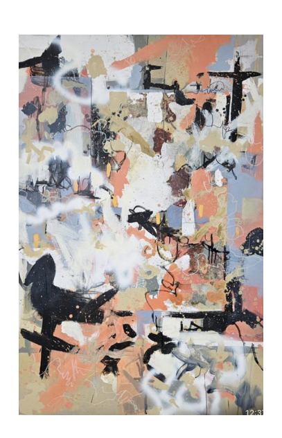
RICHARD KETLEY Southern Runes, 2024 Acrylic and mixed media on canvas 150 x 100 x 4.7 cm ZAR 62,000