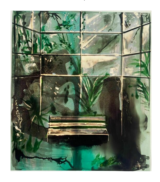
ELODIE BURLS Reconsider, 2024 Ink on waterproof paper 59 x 44 cm Framed: 60.5 x 54 x 3.5 cm ZAR 10,000