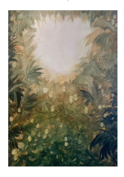
ZARAH CASSIM Landing, 2024 Oil on canvas 119 x 84 x 1.5 cm ZAR 55,000