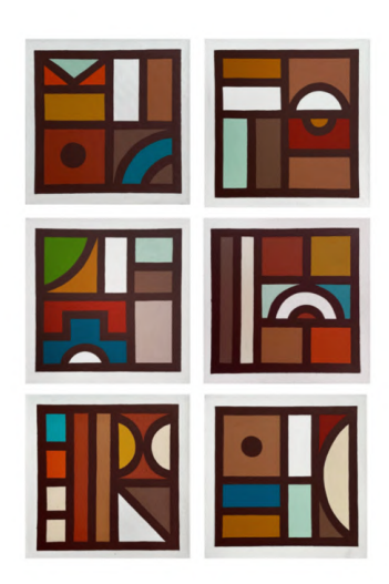
BABA TJEKO Nalane e ntle, 2024 Acrylic on canvas 30.5 x 30.5 x 2.5 cm (each in the set of six) ZAR 34,500