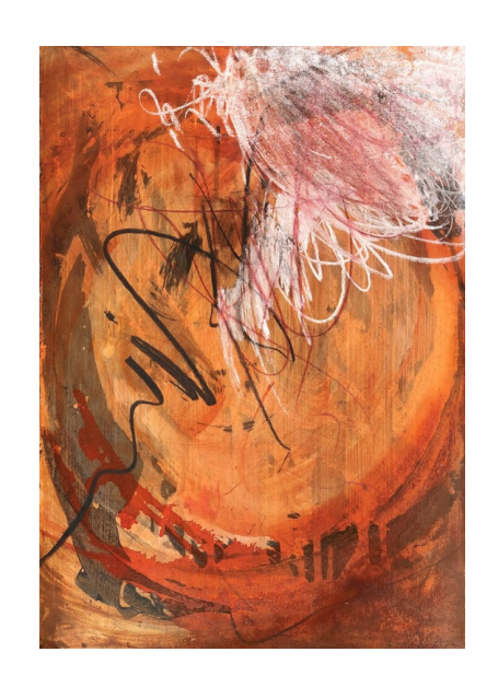
EMMA ASPELING Playing (into the well), 2024 Mixed media on paper 49 x 35 cm Framed: 60 x 46 x 3.5 cm ZAR 12,500