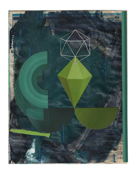
NICHOLAS HALES Heart diamond, 2024 Mixed media on paper 27 x 21 cm Framed: 34 x 29 x 4.5 cm ZAR 10,000