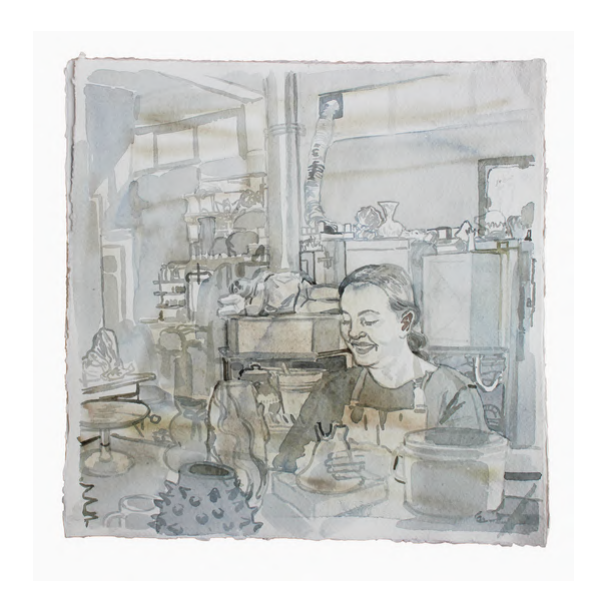
ISABELLA KUIJERS Ceramic Studio 5, 2024 Watercolour on paper 29.5 x 29.5 cm Framed: 37.3 x 37.3 x 3.5 cm ZAR 12,000