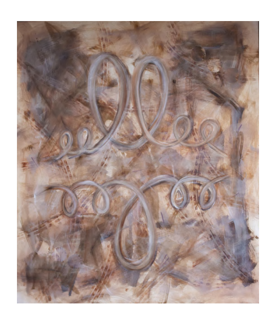
DAUDI KAGGWA A Flow State of Mind (In the Midst of Confusion), 2023 Acrylic on stretched canvas 140 x 119.5 x 2.3 cm ZAR 33,000