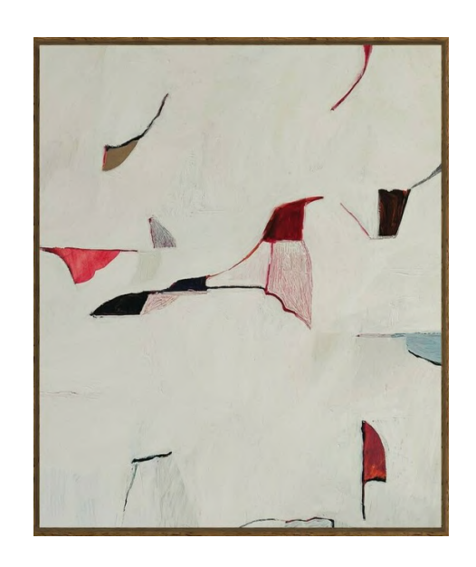
LAURINDA BELCHER Hieroglyphics to Honour the Home, 2024 Oil on Italian cotton 60 x 50 cm Framed: 62 x 52 x 3.5 cm ZAR 16,000