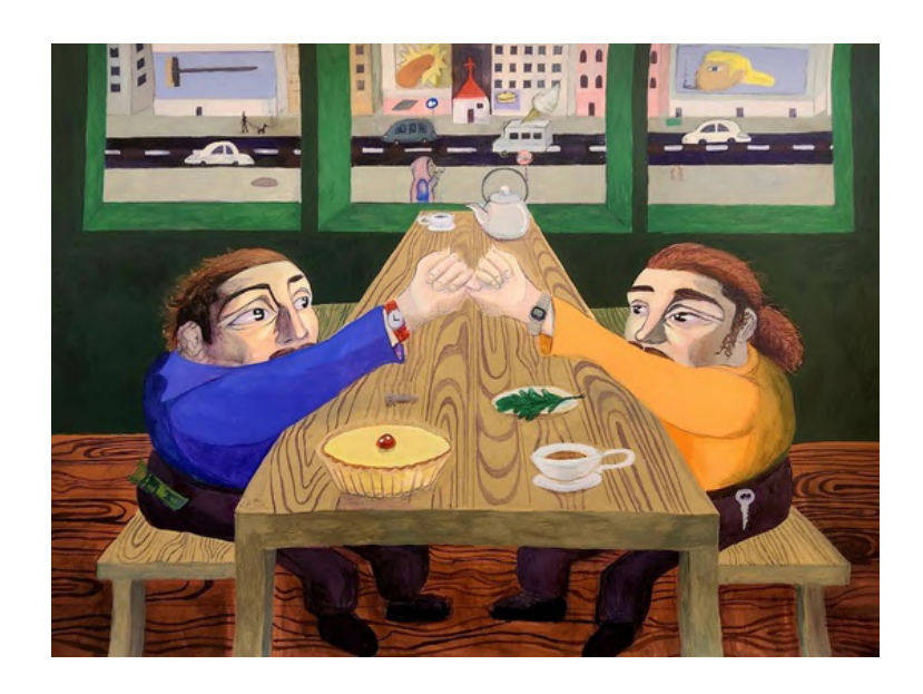
GENE LESOUW It's been a long time, hasn't it?, 2024 Gouache on paper 41 x 58 cm Framed: 59 x 76 x 3 cm ZAR 16,000