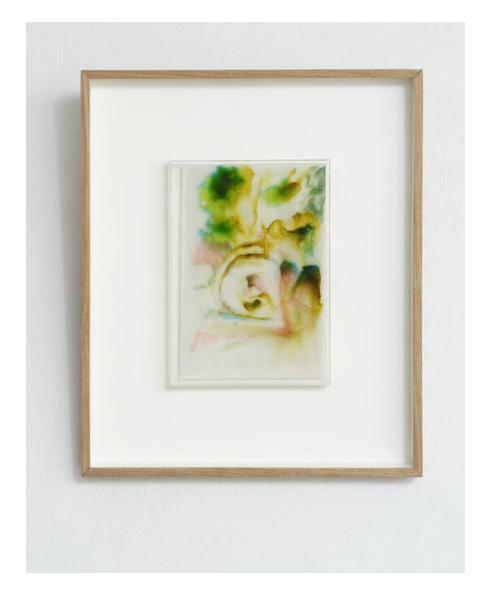
XANTHE SCOUT LARDNER-BURKE Three Boys with Tire, 2024 Water-based substrates on rice paper on draft film in uv protected epoxy resin 21.5 \times 15.2 \text{ cm} Framed: 38.5 \times 32.3 \times 3.5 \text{ cm} ZAR 16,000