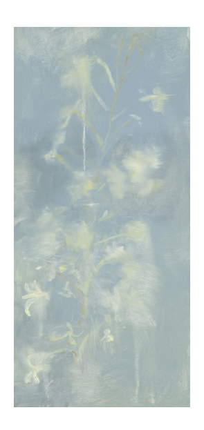
REBECCA GOLDBERG Witpypie, 2024 Oil on panel 50 x 23 cm Framed: 51.8 x 25 x 3.5 cm ZAR 9,000