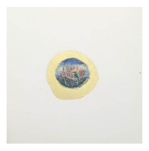
KATRINE CLAASSENS Sunbird & Aloe, 2024 Acrylic on 23 karat gold on archival cotton paper 16 \times 16 cm Framed: 18.5 \times 18.5 \times 3.5 cm ZAR 4,000