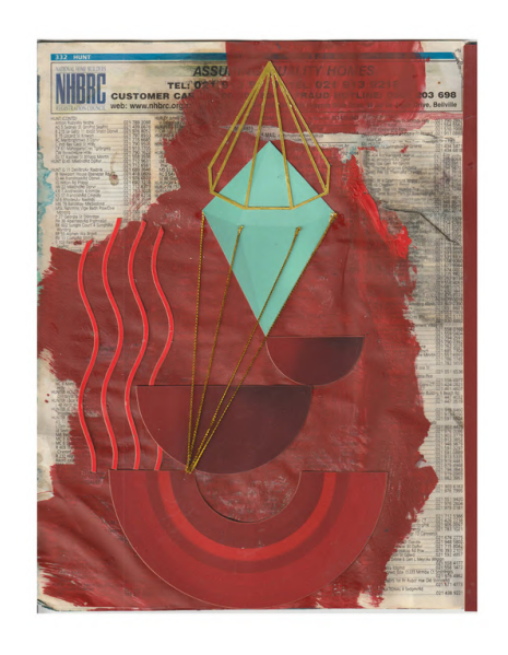
NICHOLAS HALES Heart and fire, 2024 Mixed media on paper 27 x 21 cm Framed: 34 x 29 x 4.5 cm ZAR 10,000