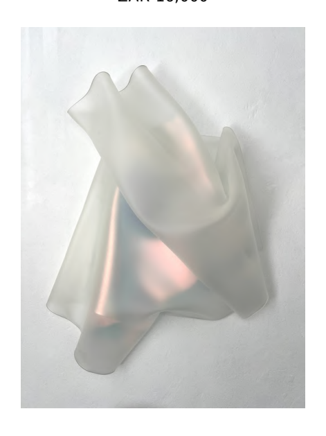
LISA BREEN Chrysalis, 2023 Acrylic sheet sculpture 100 x 80 x 25 cm ZAR 55,000