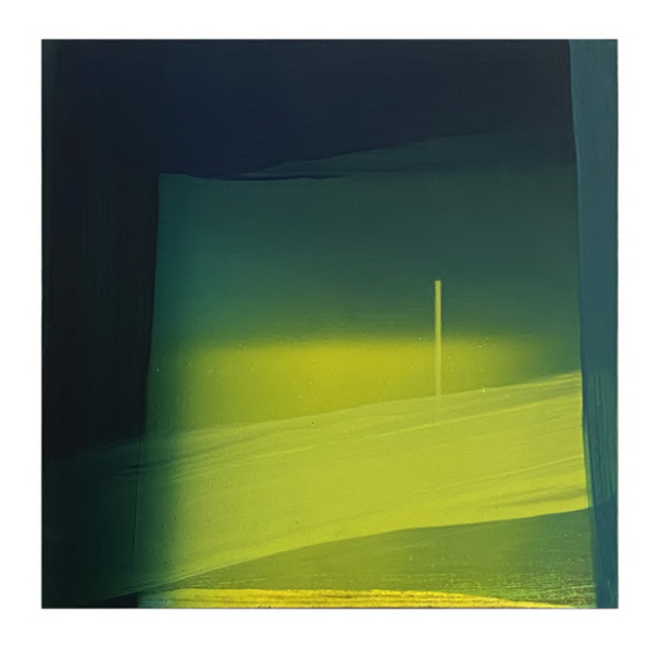
NICHOLAS HALES Golden light, 2024 Oil and acrylic on wood 30 x 30 cm Framed: 32 x 32 x 4.5 cm ZAR 15,000