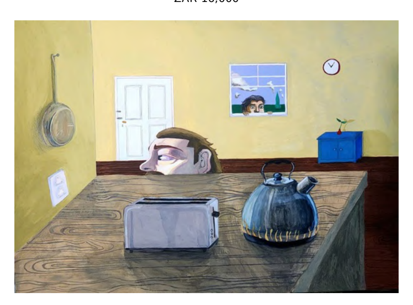
GENE LESOUW A watched kettle will not boil, 2024 Gouache on paper 41 x 58 cm Framed: 59 x 76 x 3 cm ZAR 16,000