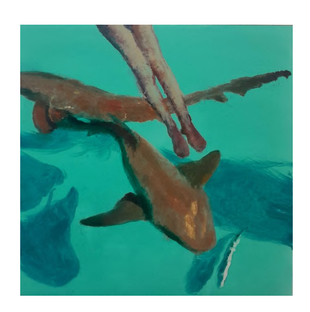
CLARE MENCK Nurse sharks & naked pair of legs, 2024 Monotype Framed: 46.7 x 46.7 x 2.2 cm ZAR 8,000