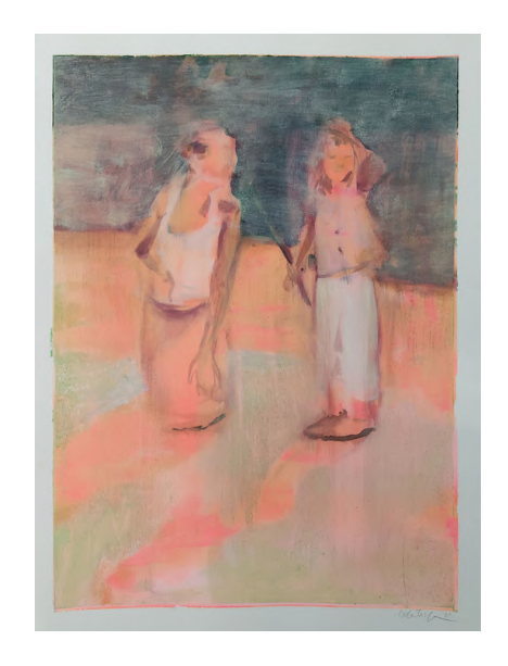
ODA TUNGODDEN page 34, 2022 Oil and acrylic on Fabriano Tela Framed: 48 x 38 x 3.5 cm ZAR 6,500