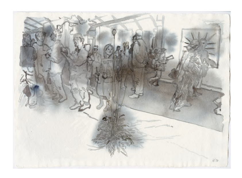
ISABELLA KUIJERS Frieze, 2024 Watercolour on paper 30 x 41 cm Framed: 36.8 x 49 x 3.5 cm ZAR 14,000