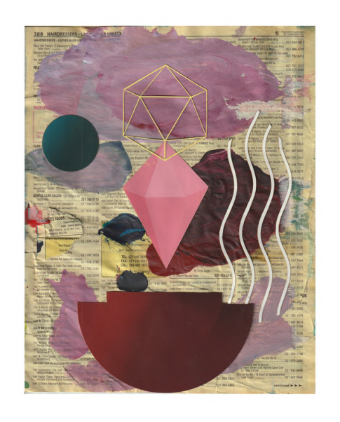
NICHOLAS HALES Untitled, 2024 Mixed media on paper 27 x 21 cm Framed: 34 x 29 x 4.5 cm ZAR 10,000