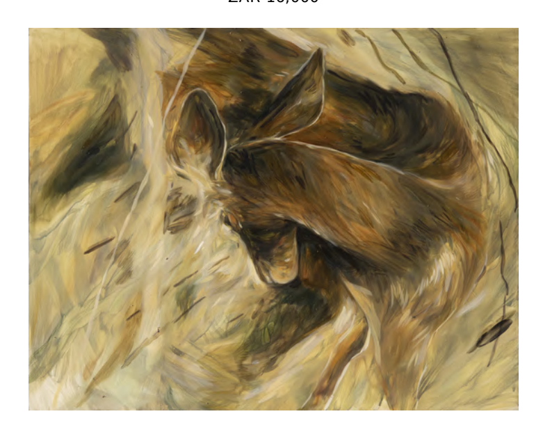
HEIDI FOURIE Nestled, 2024 Oil on board 71 x 91 cm Framed: 73 x 93.5 x 5 cm ZAR 30,000