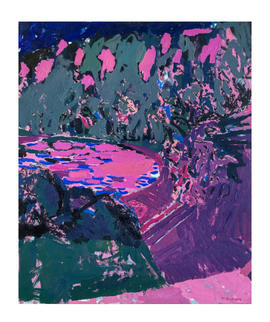
MICHAEL BECKURTS Luminous I, 2024 Oil and charcoal on canvas 58 x 48 cm Framed: 60 x 50.2 x 3.5 cm ZAR 24,000