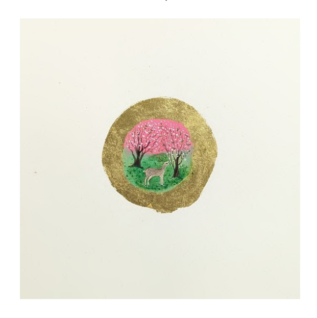
KATRINE CLAASSENS Deer Amidst The Blossom Trees, 2024 Acrylic on 23 karat gold on archival cotton paper 15 x 15 cm Framed: 23.5 x 23.5 x 3.5 cm ZAR 4,500