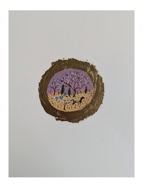
KATRINE CLAASSENS Escape Through Cyprus And Blossom Trees, 2024 Acrylic on 23 karat gold on archival cotton paper 32 x 24 cm Framed: 40.5 x 31.5 x 3.5 cm ZAR 8,500