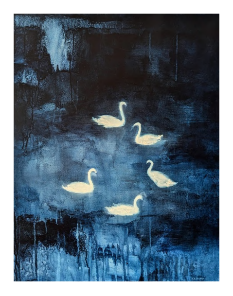
KATRINE CLAASSENS The Sweet Water Sea Swans, 2024 Oil on canvas 65 x 55 cm Framed: 67.5 x 57.5 x 5.3 cm ZAR 24,000