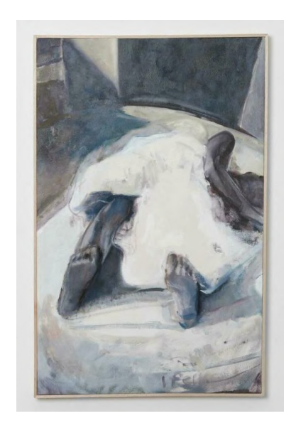
JOËLLE JOUBERT I Fell , 2024 Oil on canvas 111.5 x 71.3 cm Framed: 113.5 x 73.3 x 4.5 cm ZAR 26,000