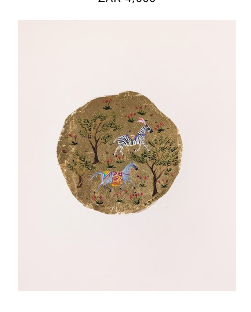
KATRINE CLAASSENS We Made A Dash Of It And Left The Circus To Its Dust, 2024 Acrylic on 23 karat gold on archival cotton paper 19 x 19 cm Framed: 27.5 x 27.5 x 3.5 cm ZAR 5,500