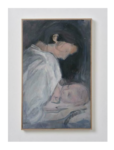
JOËLLE JOUBERT Mother and baby (at her breast), 2024 Oil on canvas 80 x 49.5 cm Framed: 84 x 53.5 x 4.5 cm ZAR 21,000