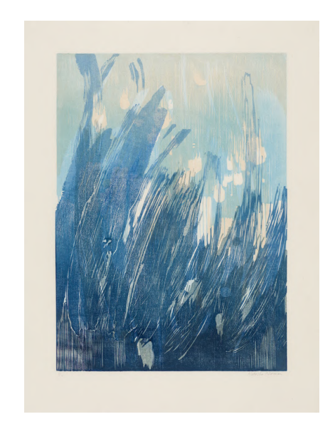
NATASHA NORMAN What Joy to Come Falling, 2023 Mokuhanga woodblock print 61 x 46 cm Framed: 67 x 51.8 x 4.5 cm ZAR 10,000