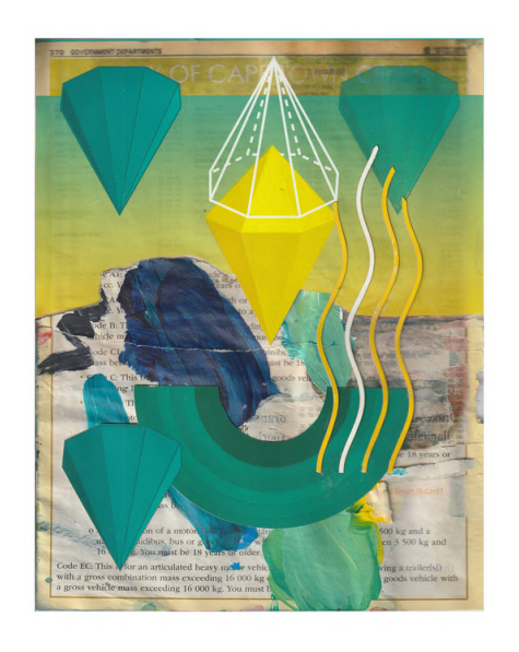
NICHOLAS HALES Ascent/descent, 2024 Mixed media on paper 27 x 21 cm Framed: 34 x 29 x 4.5 cm ZAR 10,000