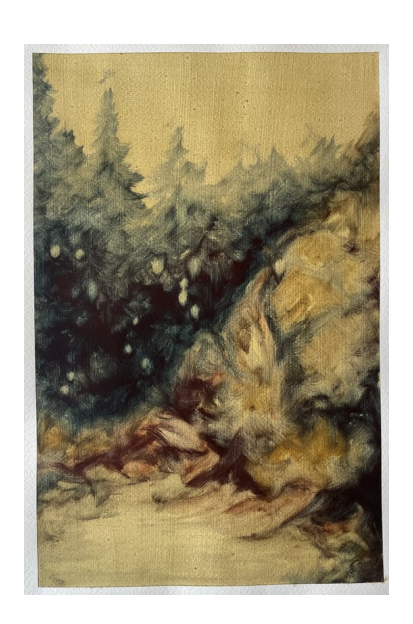
ZARAH CASSIM Mountain, 2024 Oil on Fabriano 37 x 25 cm Framed: 45 x 33 x 3.5 cm ZAR 13,000