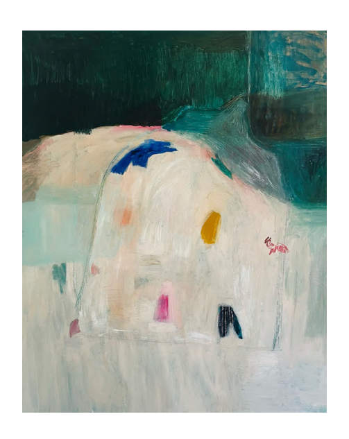
LAURINDA BELCHER The Joy of Discovery, 2023 Oil on Italian cotton 120 x 100 x 3.5 cm ZAR 32,000