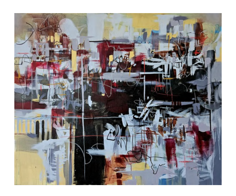
RICHARD KETLEY The City I Live in V, 2024 Acrylic and crayon on canvas 110.5 x 134.5 x 4.5 cm ZAR 60,000