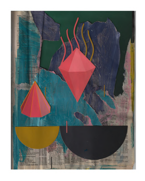
NICHOLAS HALES Heat, 2024 Mixed media on paper 27 x 21 cm Framed: 34 x 29 x 4.5 cm ZAR 10,000