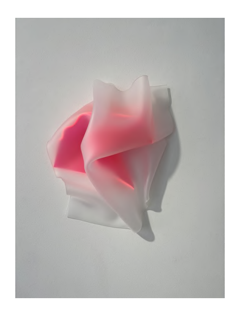
LISA BREEN Transparent Love, 2023 Acrylic sheet sculpture 53 x 43 x 17 cm ZAR 28,000