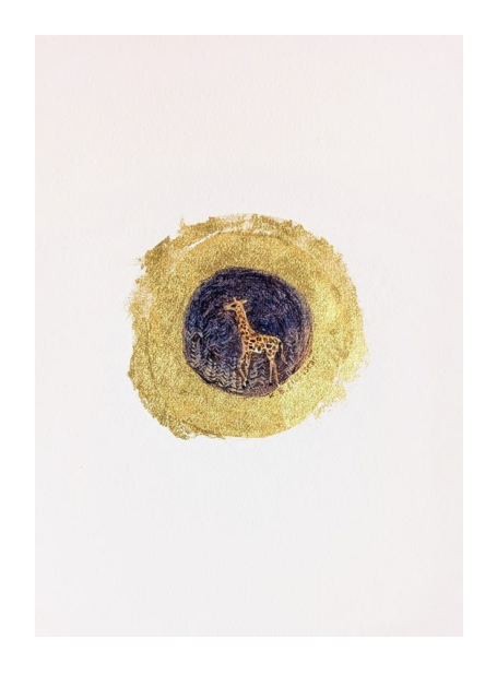
KATRINE CLAASSENS Small Giraffe (New To The World), 2024 Acrylic on 23 karat gold on archival cotton paper 13 x 10.5 cm Framed: 21.5 x 18 x 3.5 cm ZAR 3,500