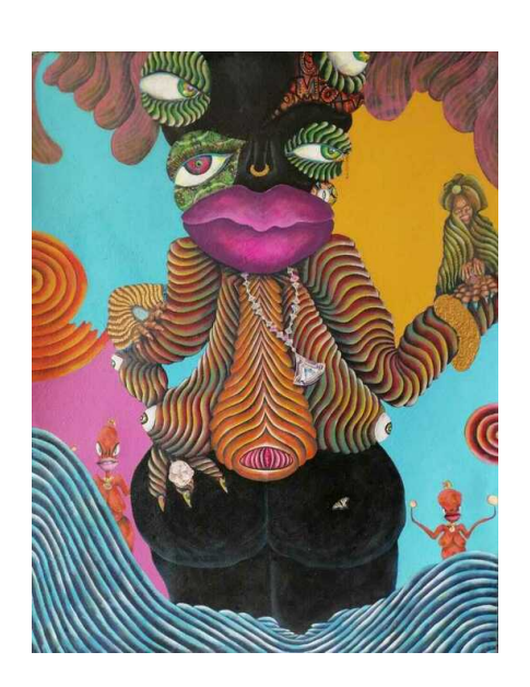
MADIKOTSI 'MUMMY' KHUMALO MOTHER MOUNTAIN, 2024 Acrylic, collage and candle drops on unstretched canvas 124.5 \times 97 cm ZAR 60,000