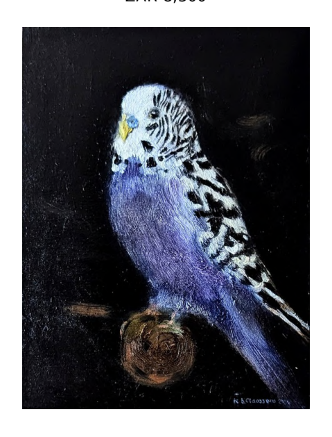
KATRINE CLAASSENS Indigo Bird / Blue Budgie, 2024 Oil on poplar wood 20.5 x 15 x 4 cm ZAR 5,500