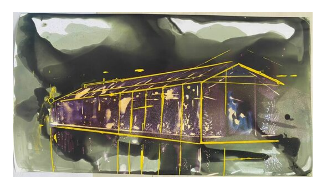
ELODIE BURLS Polinate, 2024 Ink on waterproof paper 25.5 x 46 cm Framed: 35 x 55.5 x 3.5 cm ZAR 7,000