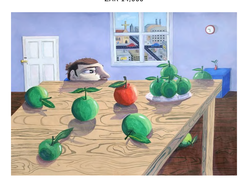
GENE LESOUW I bought too many apples, 2024 Gouache on paper 41 x 58 cm Framed: 59 x 76 x 3 cm ZAR 16,000