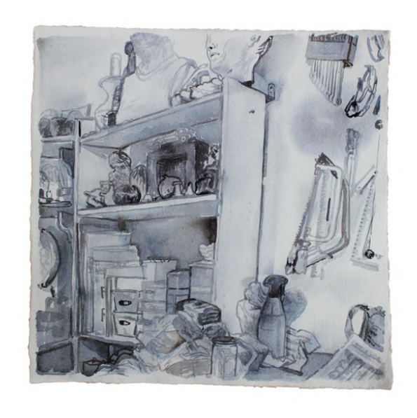
ISABELLA KUIJERS Ceramic Studio 3, 2024 Watercolour on paper 29.5 x 29.5 cm Framed: 37.3 x 37.3 x 3.5 cm ZAR 12,000