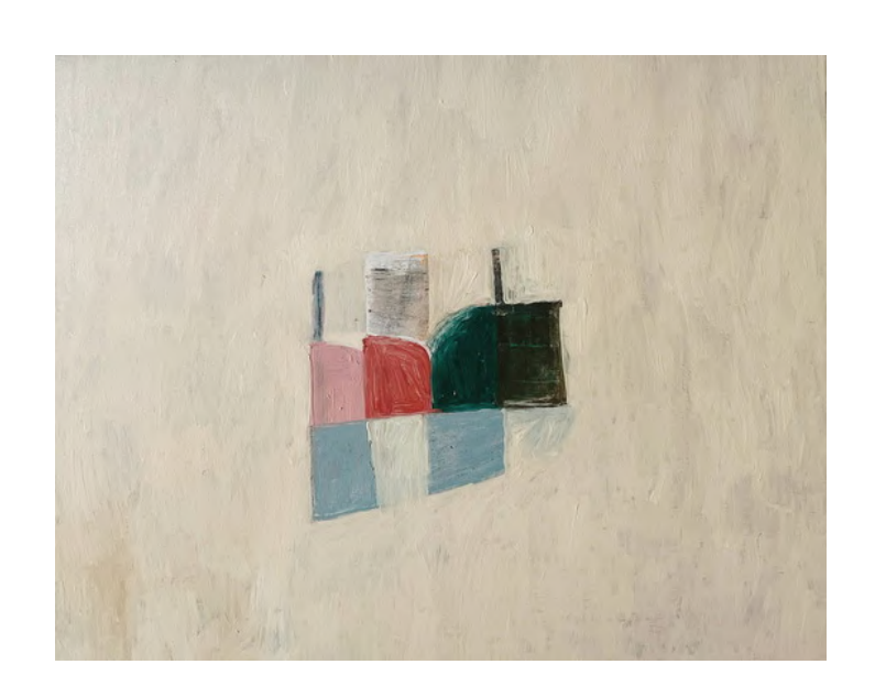
LAURINDA BELCHER House Warming, 2024 Acrylic on Italian cotton 40 x 50 cm Framed: 42 x 52 x 3.5 cm ZAR 13,000