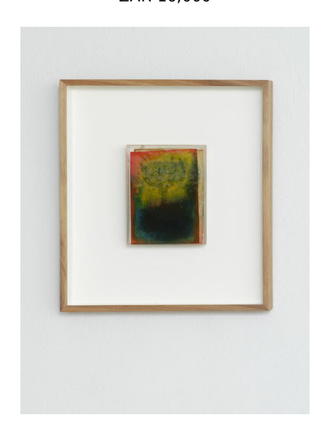
XANTHE SCOUT LARDNER-BURKE Autumn\ Fire\ Tree,\ 2024 Water-based substrates on rice paper on draft film in uv protected epoxy resin 13\times10\ cm Framed: 30\times27\times3.5\ cm ZAR 12,000