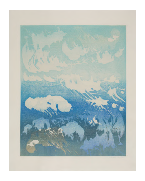
NATASHA NORMAN The Invisible Sea (Naval Hill), 2024 Mokuhanga woodblock print 61 x 46 cm Framed: 63.5 x 49.5 x 3.5 cm ZAR 9,000