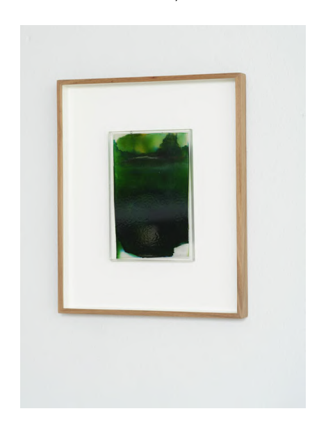
XANTHE SCOUT LARDNER-BURKE \it Village Green Green, 2024 Water-based substrates on rice paper on draft film in uv protected epoxy resin \it 21 \times 14.2 \ cm \it Framed: 38 \times 31.2 \times 3.5 \ cm \it ZAR 15,500