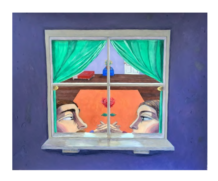
GENE LESOUW The couple in the window, 2024 Gouache on paper 39.5 x 39.5 cm Framed: 57.8 x 57.8 x 3 cm ZAR 14,000