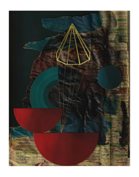
NICHOLAS HALES Ascention, 2024 Mixed media on paper 27 x 21 cm Framed: 34 x 29 x 4.5 cm ZAR 10,000