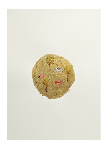
KATRINE CLAASSENS Escape Of The Tiger (We'd Hide Among The Lemon Trees), 2024 Acrylic on 23 karat gold on archival cotton paper 31.5 x 24 cm Framed: 40.5 x 31.5 cm ZAR 10,000