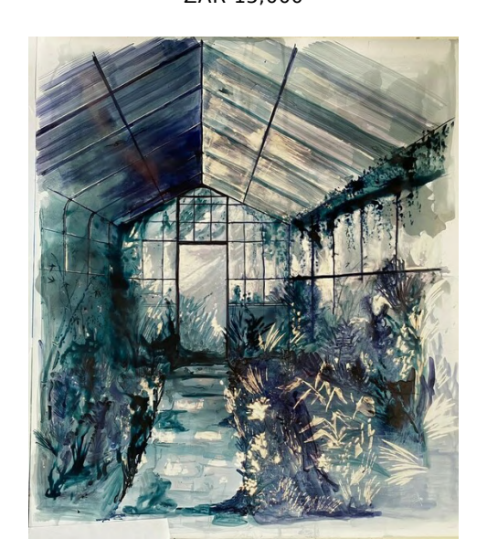
ELODIE BURLS We Cannot Eat Money, 2024 Ink on waterproof paper 106 x 92 cm Framed: 116 x 101 x 3.5 cm ZAR 20,000