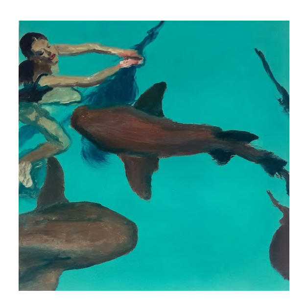
CLARE MENCK Swimmer with nurse sharks, 2024 Monotype Framed: 46.7 x 46.7 x 2.2 cm ZAR 8,000