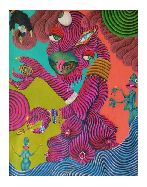
MADIKOTSI 'MUMMY' KHUMALO GOGO\ WATER\text{-}FALL,\ 2024 Acrylic, collage and candle drops on unstretched canvas 124.5\ x\ 97\ cm ZAR\ 60,000