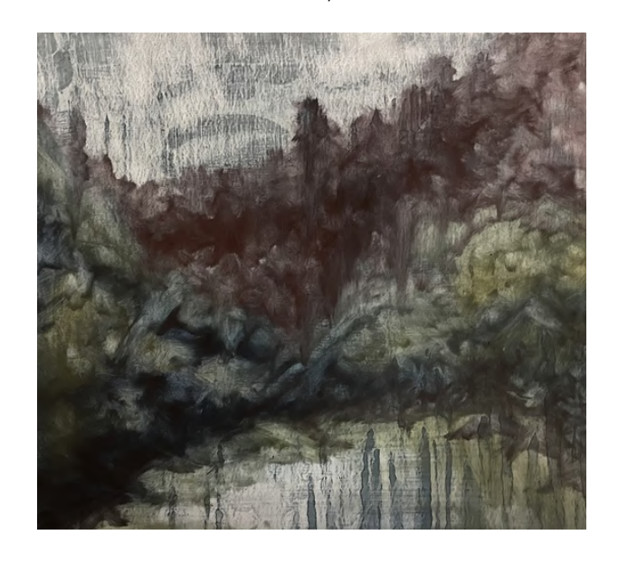
ZARAH CASSIM Deep Dark, 2024 Oil on paper 28 x 32 cm Framed: 35.5 x 39 x 3.5 cm ZAR 13,000