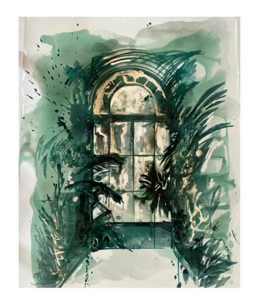
ELODIE BURLS The Other Side, 2024 Ink on waterproof paper 92 x 74 cm Framed: 103 x 83.5 x 3.5 cm ZAR 15,000