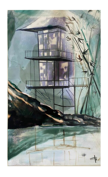
ELODIE BURLS Contemplate, 2024 Ink on waterproof paper 46 x 28 cm Framed: 55.5 x 37 x 3.5 cm ZAR 7,000