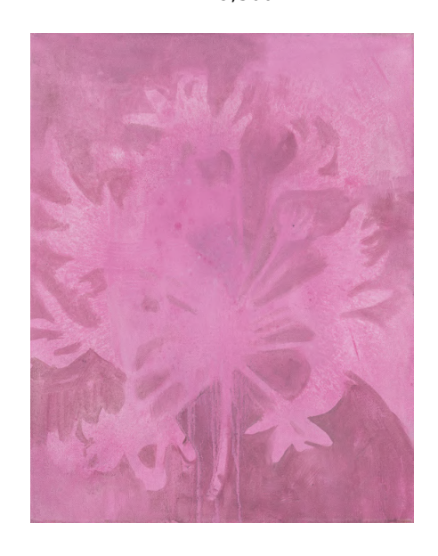
REBECCA GOLDBERG Brunsvigia, 2023 Oil on canvas 45.5 x 35.5 cm Framed: 47.5 x 37.5 x 5.5 cm ZAR 9,000