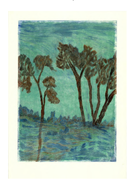
ULRICHE JANTJES Wind in the trees II, 2024 Oil-based monotype with colour pencils on Fabriano Unica 43 \times 30.5 \text{ cm} Framed: 49.5 \times 36.5 \times 3.5 \text{ cm} ZAR 11,500