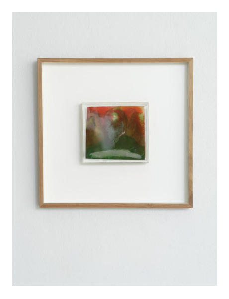
XANTHE SCOUT LARDNER-BURKE Tree\ Lantern,\ 2024 Water-based substrates on rice paper on draft film in uv protected epoxy resin 12\times13\ cm Framed: 28.5\times29.5\times3.5\ cm ZAR 12,000