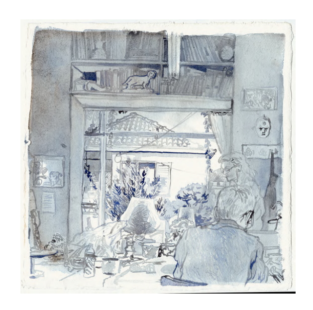
ISABELLA KUIJERS Ceramic Studio 6, 2024 Watercolour on paper 29.5 x 29.5 cm Framed: 37.3 x 37.3 x 3.5 cm ZAR 12,000