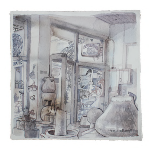
ISABELLA KUIJERS Ceramic Studio 4, 2024 Watercolour on paper 29.5 x 29.5 cm Framed: 37.3 x 37.3 x 3.5 cm ZAR 12,000