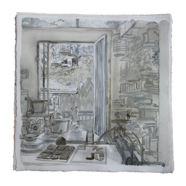
ISABELLA KUIJERS Ceramic Studio 2, 2024 Watercolour on paper 29.5 x 29.5 cm Framed: 37.3 x 37.3 x 3.5 cm ZAR 12,000