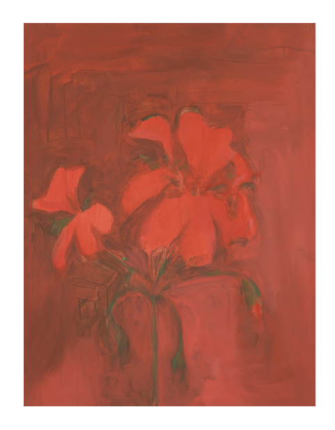
REBECCA GOLDBERG Pelargonium, 2024 Oil on panel 30 x 23 cm Framed: 32 x 25 x 3.5 cm ZAR 8,500