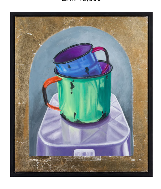
QHAMANANDE MASWANA Cups of consumption II, 2024 Acrylic and gold leaf on canvas 38.6 x 32.6 cm Framed: 40.6 x 35 x 3.5 cm ZAR 46,000