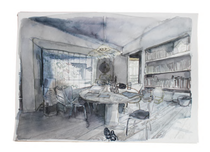
ISABELLA KUIJERS Wendy's House, 2024 Watercolour on paper 30 x 41 cm Framed: 36.8 x 49 x 3.5 cm ZAR 14,000