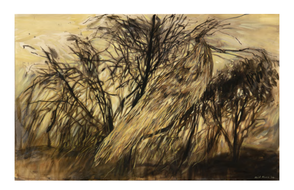
HEIDI FOURIE Swye lives on, 2024 Ink and oil on paper 77 x 120 cm Framed: 86 x 130 x 3.5 cm ZAR 40,000