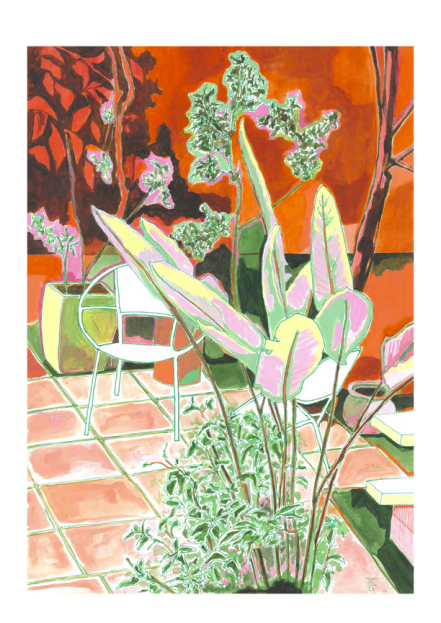
TAMSYN LANCASTER Little Joys: Those Chairs in the Yard, 2024 Fineliner and Acrylic on archival paper 41 x 29 cm Framed: 50 x 38 x 2 cm ZAR 7,800