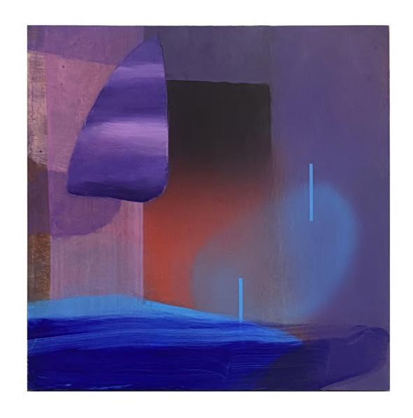
NICHOLAS HALES Doorway, 2024 Oil and acrylic on wood 30 x 30 cm Framed: 32 x 32 x 4.5 cm ZAR 15,000