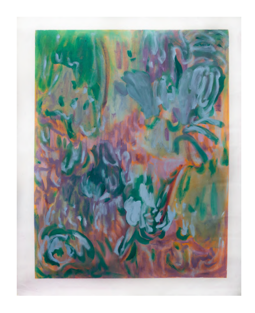
OLIVIA BOTHA The Whisper of a Thought, 2023 Oil on canvas 90 x 70 x 2 cm ZAR 25,000