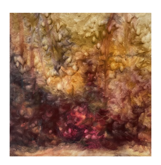
ZARAH CASSIM Summer Shadow, 2024 Oil on Fabriano 30 x 30.5 cm Framed: 38 x 38.5 x 3.5 cm ZAR 13,000