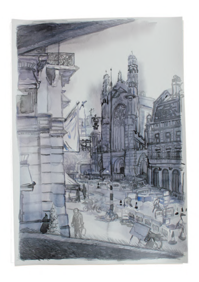
ISABELLA KUIJERS View From The 14, 2024 Watercolour on paper 41 x 30 cm Framed: 49 x 36.8 x 3.5 cm ZAR 14,000