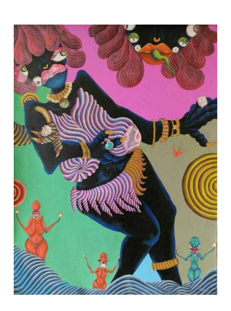
MADIKOTSI 'MUMMY' KHUMALO DAUGHTER NFULA, 2024 Acrylic, collage and candle drops of canvas 124.5 x 97 cm ZAR 60,000