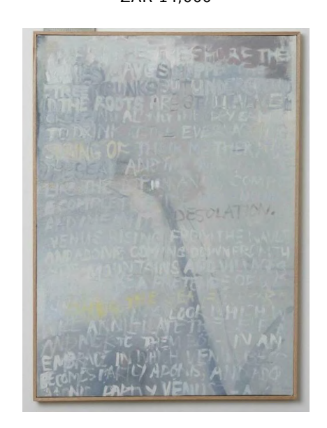
JOËLLE JOUBERT August Strindberg Text Piece, 2024 Oil on canvas 103 x 74 cm Framed: 105 x 76 x 4.5 cm ZAR 23,000