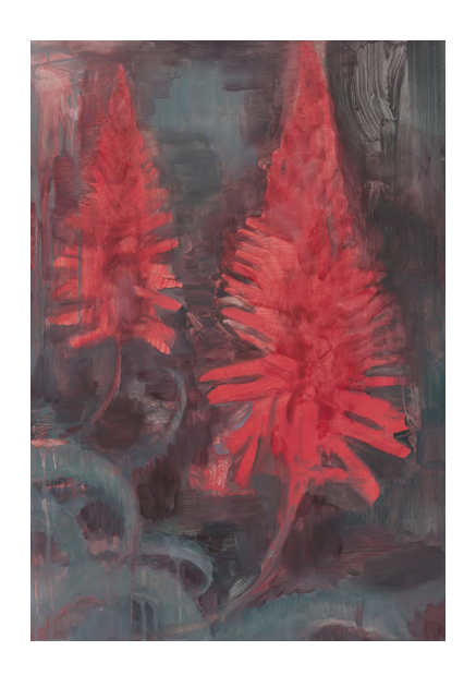
REBECCA GOLDBERG Aloe, 2023 Oil on panel 60.5 x 42 cm Framed: 62.5 x 44 x 3.5 cm ZAR 9,500