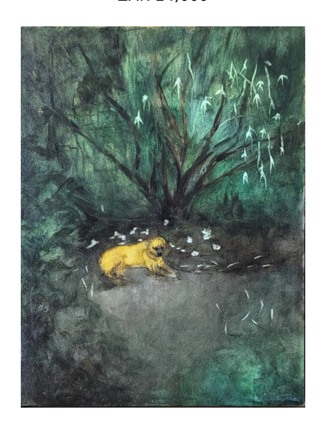
KATRINE CLAASSENS I Never Knew You, 2024 Oil on board 30.5 x 23 cm Framed: 32.5 x 24.5 x 3.5 cm ZAR 20,500