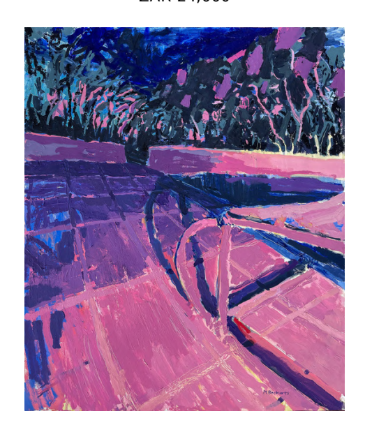
MICHAEL BECKURTS Luminous II, 2024 Oil and charcoal on canvas 66.5 x 55.5 cm Framed: 68.9 x 58 x 3.5 cm ZAR 26,000