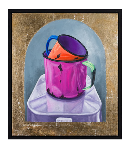
QHAMANANDE MASWANA Cups of consumption I, 2024 Acrylic and gold leaf on canvas 38.4 x 33.3 cm Framed: 40.6 x 35.7 x 3.5 cm ZAR 46,000