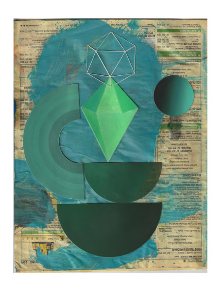
NICHOLAS HALES Green diamond (heart) and white hexagon, 2024 Mixed media on paper 27 x 21 cm Framed: 34 x 29 x 4.5 cm ZAR 10,000