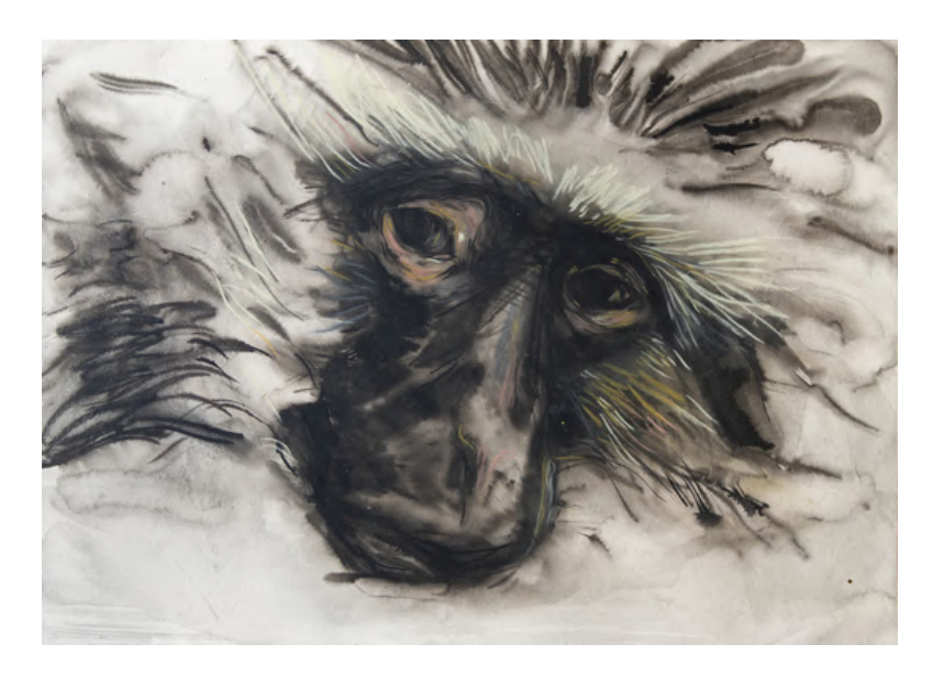
HEIDI FOURIE Defeated I, 2024 Ink and pastel on paper 40 x 56 cm Framed: 48.5 x 65.5 x 3.5 cm ZAR 16,000