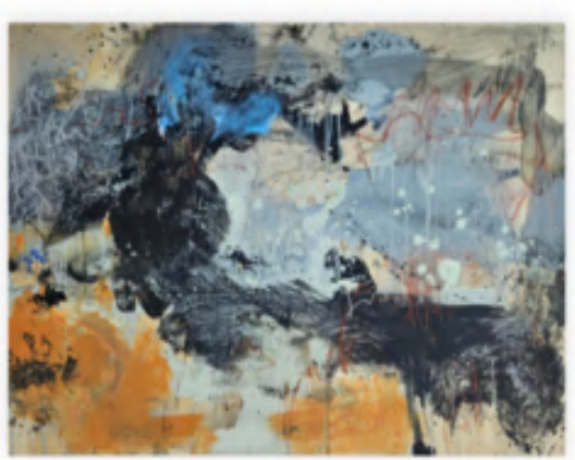
RICHARD KETLEY Heart Veld - Diptych Size, 2024 Acrylic on plywood 70 x 200 x 4.5 cm ZAR 67,000