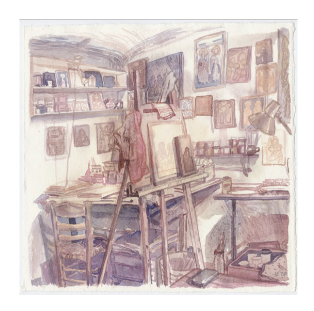
ISABELLA KUIJERS The Iconographer's Studio, 2024 Watercolour on paper 29.5 x 29.5 cm Framed: 37.3 x 37.3 x 3.5 cm ZAR 12,000