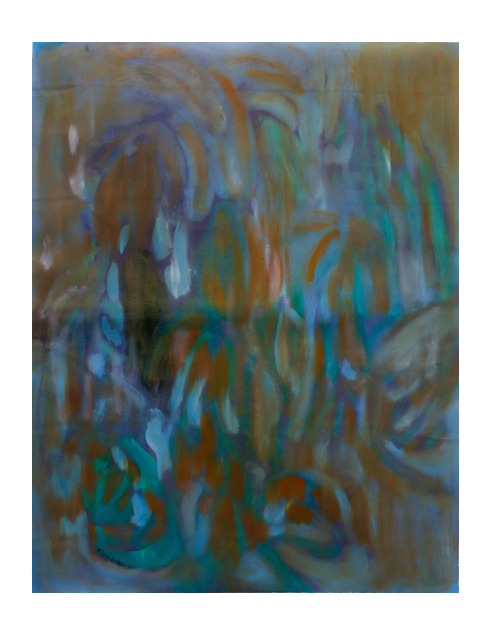
OLIVIA BOTHA My Autumn Dream, 2023 Oil on canvas Framed: 90.5 x 70.5 x 3.5 cm ZAR 27,000