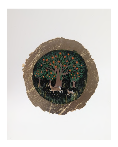
KATRINE CLAASSENS I'll Follow You (The Deer), 2024 Acrylic on 23 karat gold on archival cotton paper 32 x 23.5 cm Framed: 40.5 x 31.5 x 3.5 cm ZAR 8,500