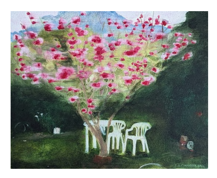
KATRINE CLAASSENS Newlands Blossom Tree (The Third Point Of Life), 2024 Oil on board 20.2 x 25.4 cm Framed: 22.2 x 27.2 x 35 cm ZAR 8,500