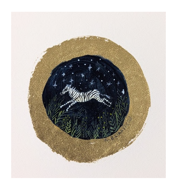
KATRINE CLAASSENS Midnight's Zebra, 2024 Acrylic on 23 karat gold on archival cotton paper 14.5 x 14.5 cm Framed: 23 x 23 x 3.5 cm ZAR 4,000