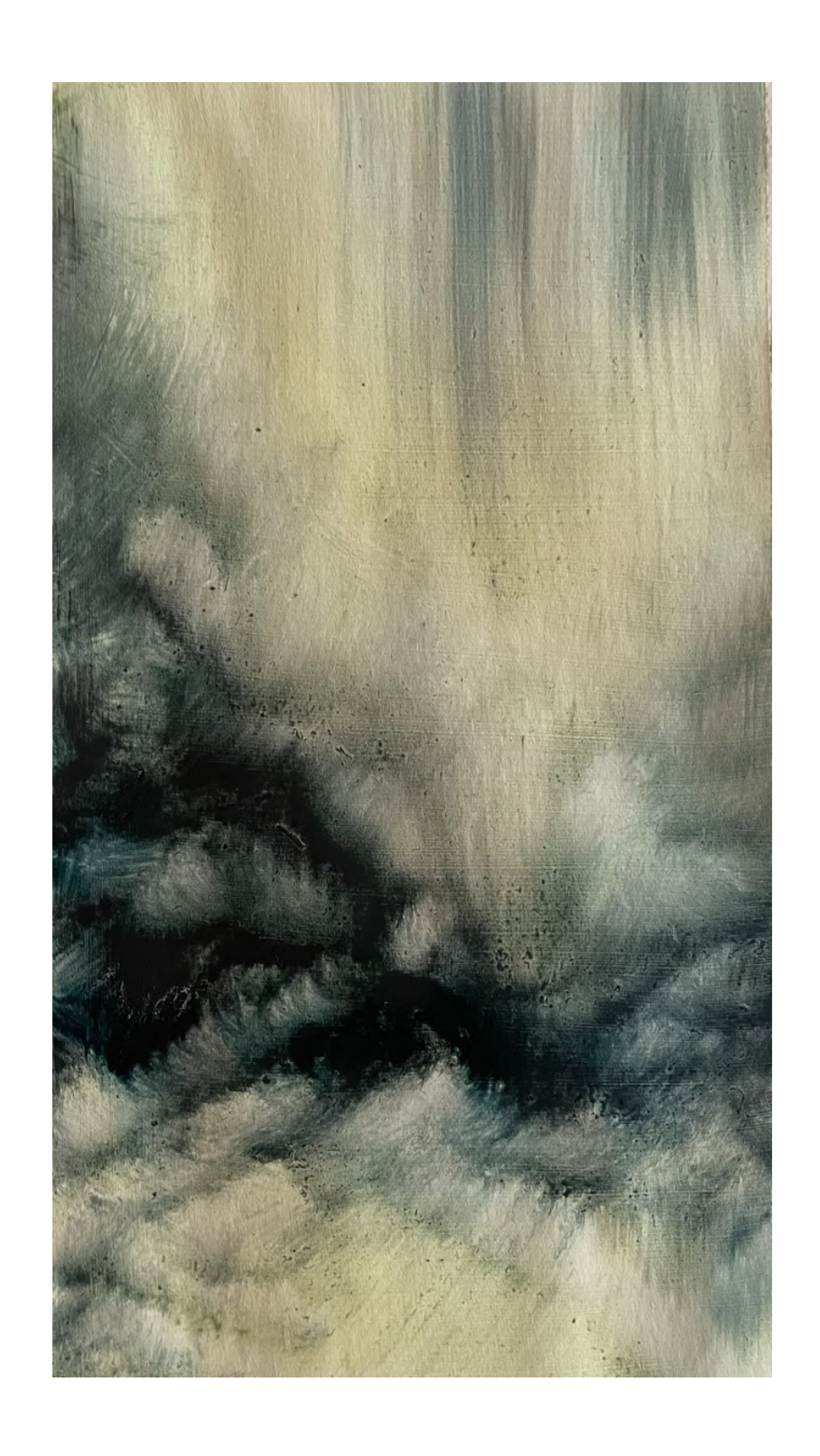
ZARAH CASSIM Frost I, 2024 Oil on paper 18 x 10.5 cm Framed: 27 x 19.5 x 2.2 cm ZAR 6,500