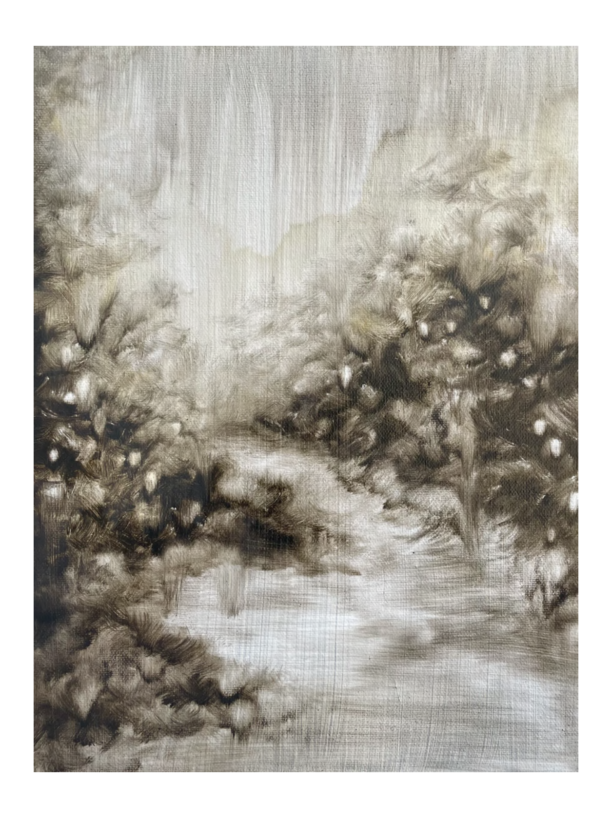
ZARAH CASSIM Earth, 2023 Oil on canvas 32 x 25 x 2 cm ZAR 18,000