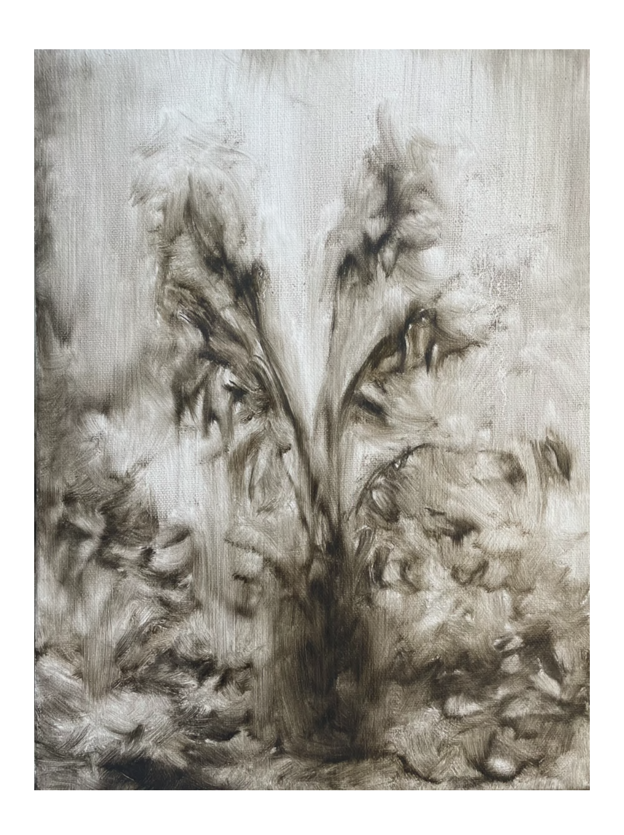
ZARAH CASSIM Flowers I, 2023 Oil on canvas 32 x 25 x 2 cm ZAR 18,000