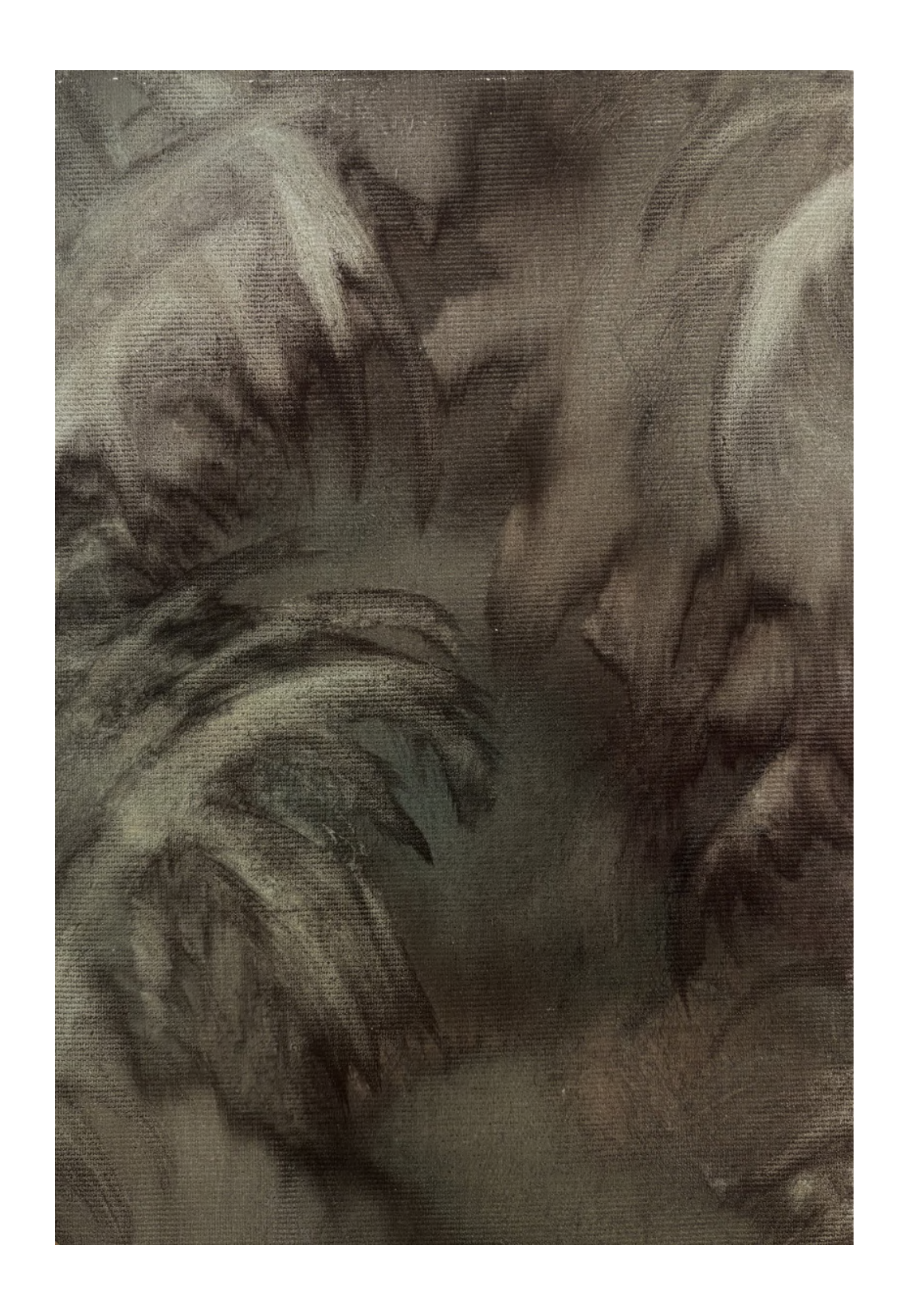
ZARAH CASSIM Thoughts II, 2024 Oil on canvas 28.5 x 19.5 x 2 cm ZAR 15,000