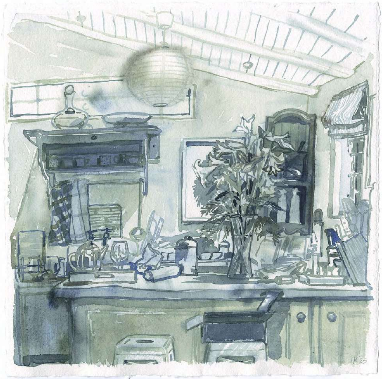
ISABELLA KUIJERS kitchen 1, 2025 Watercolour on paper 29 x 29 cm Framed: 37.5 x 37.5 x 3.5 cm ZAR 12,000