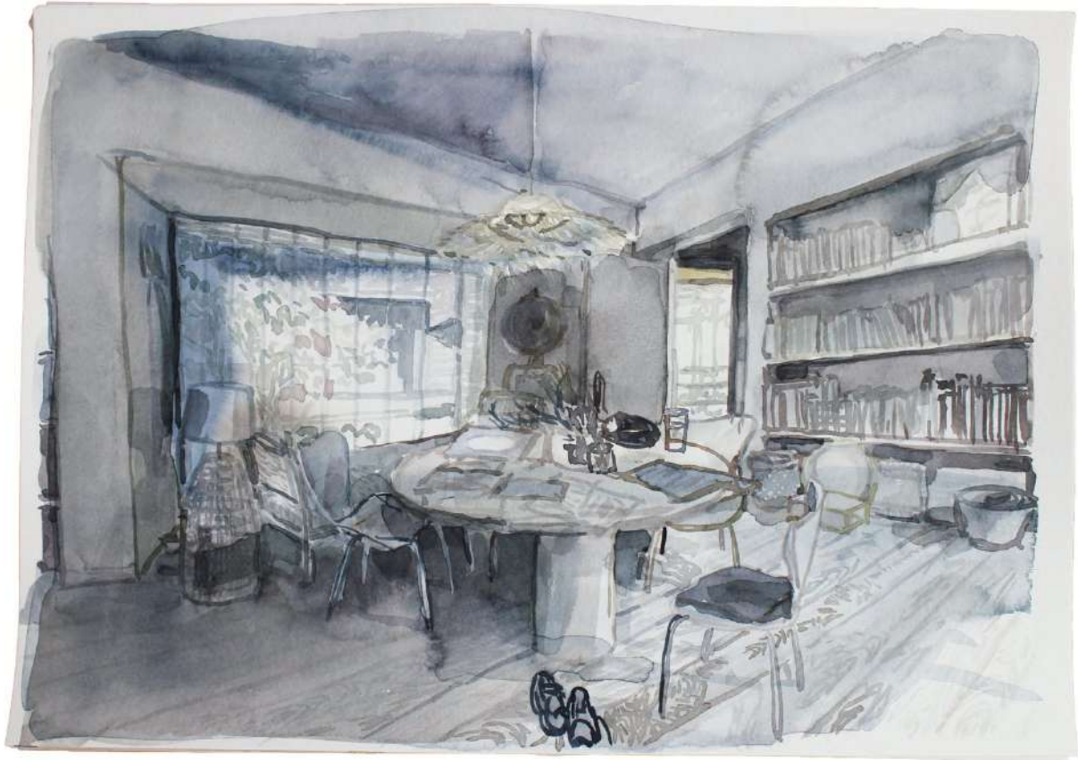
ISABELLA KUIJERS Wendy's House, 2024 Watercolour on paper 30 x 41 cm Framed: 36.8 x 49 x 3.5 cm ZAR 14,000