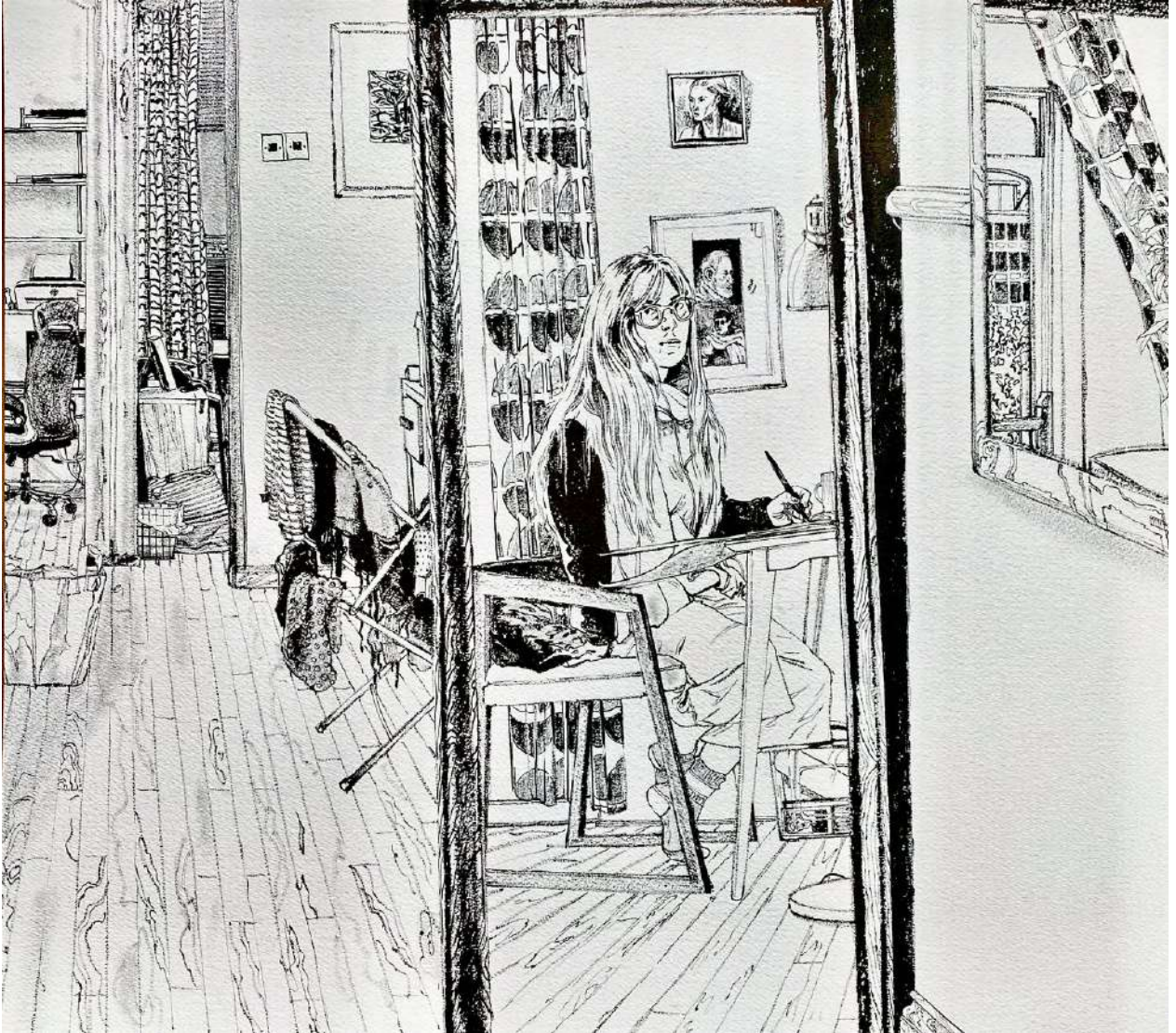
ISABELLA KUIJERS Self Portrait, 2023 Brushpen on paper Framed: 47.5 x 54.5 x 3.5 cm ZAR 18,000