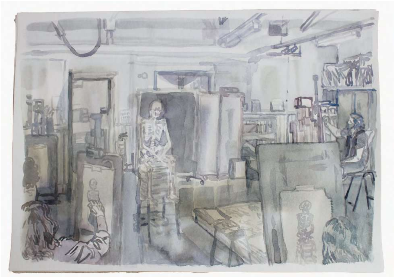
ISABELLA KUIJERS Drawing Fred, 2024 Watercolour on paper 30 x 41 cm Framed: 36.8 x 49 x 3.5 cm ZAR 14,000