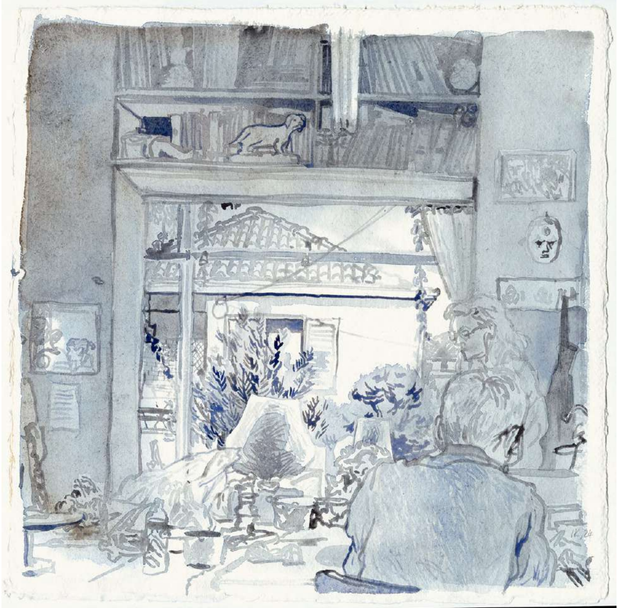
ISABELLA KUIJERS Ceramic Studio 6 , 2024 Watercolour on paper 29.5 x 29.5 cm Framed: 37.3 x 37.3 x 3.5 cm ZAR 12,000