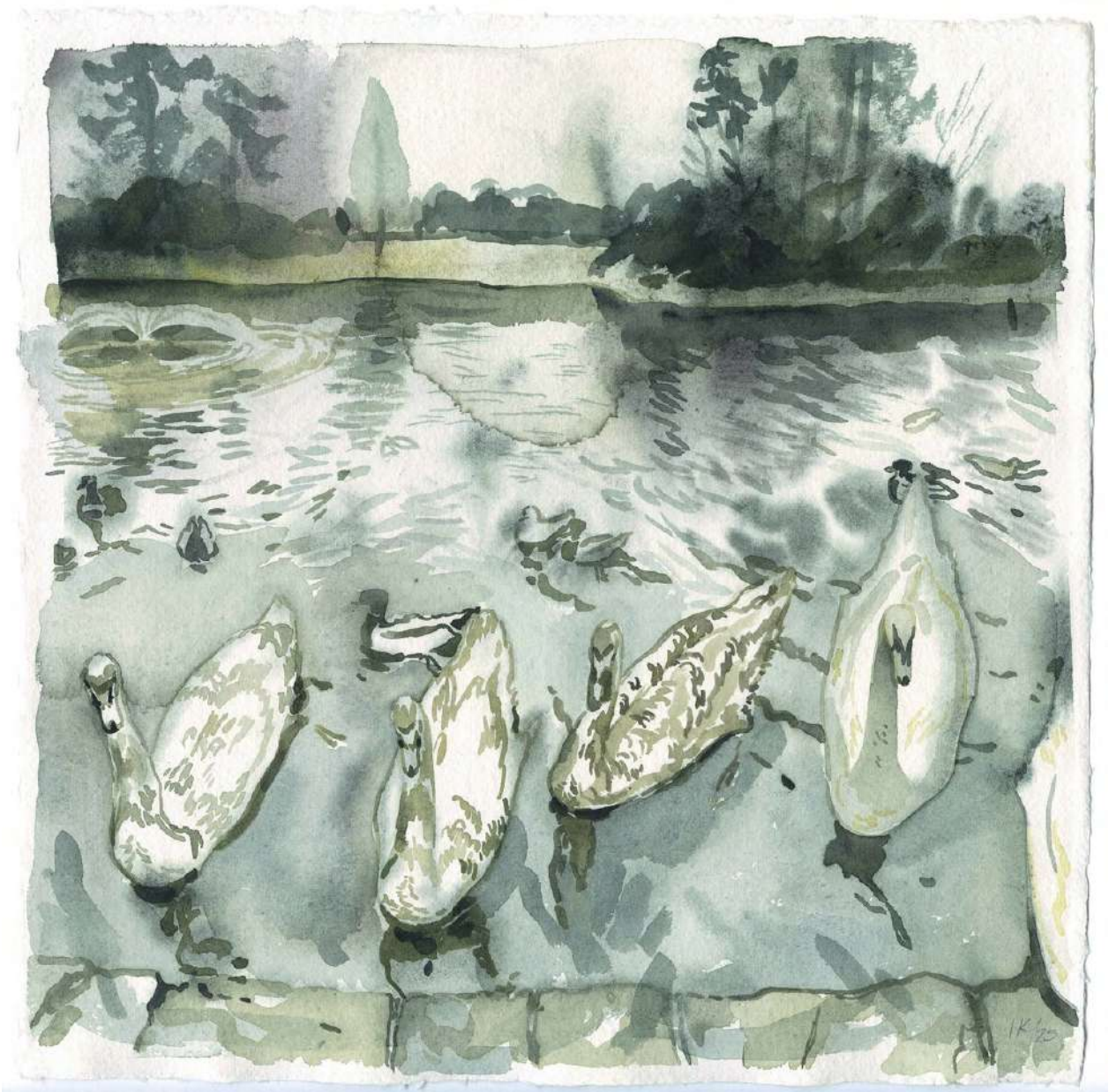
ISABELLA KUIJERS Signets , 2025 Watercolour on paper 30 x 30 cm Framed: 37.5 x 37.5 x 3.5 cm ZAR 12,000