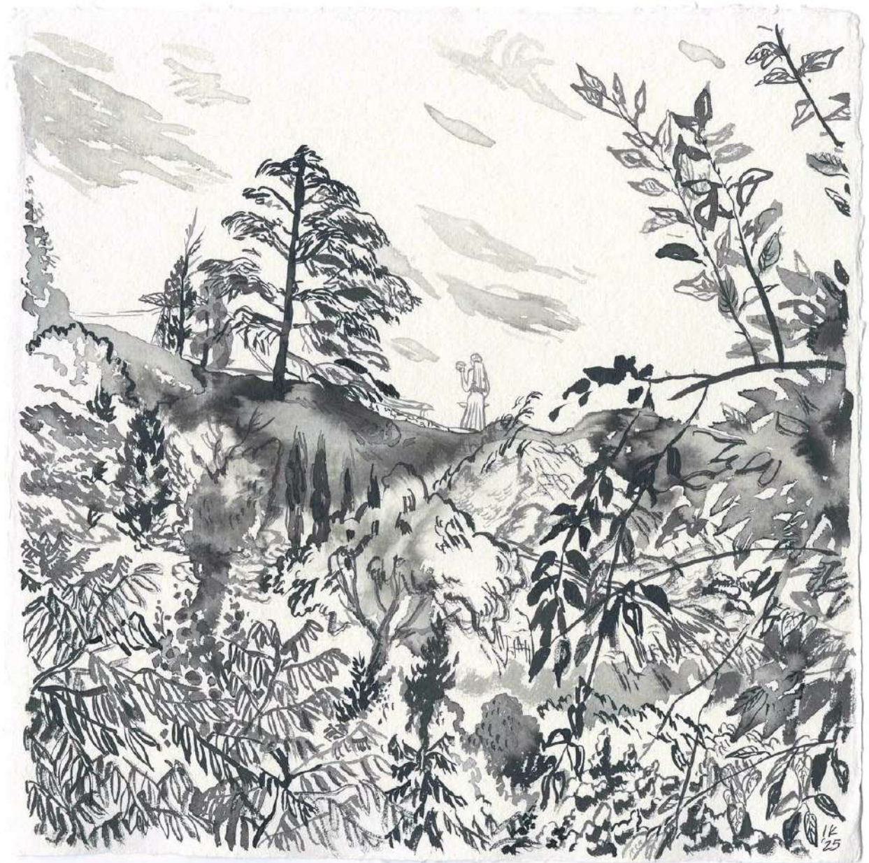
ISABELLA KUIJERS mother of Georgia, 2025 Ink on paper 30 x 30 cm Framed: 37.5 x 37.5 x 3.4 cm ZAR 12,000