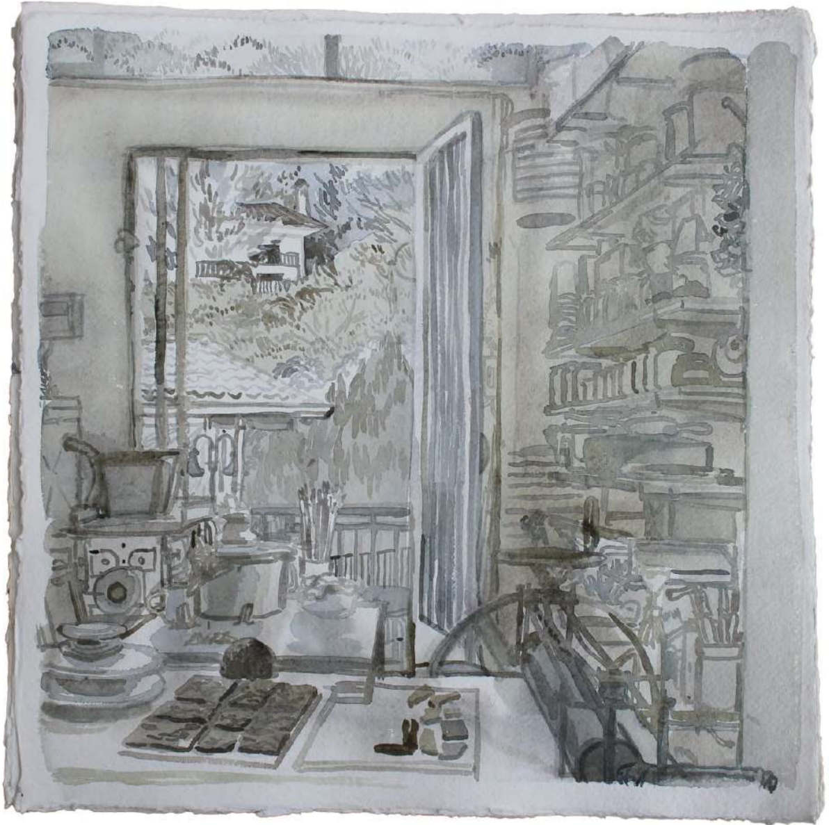
ISABELLA KUIJERS Ceramic Studio 2 , 2024 Watercolour on paper 29.5 x 29.5 cm Framed: 37.3 x 37.3 x 3.5 cm ZAR 12,000