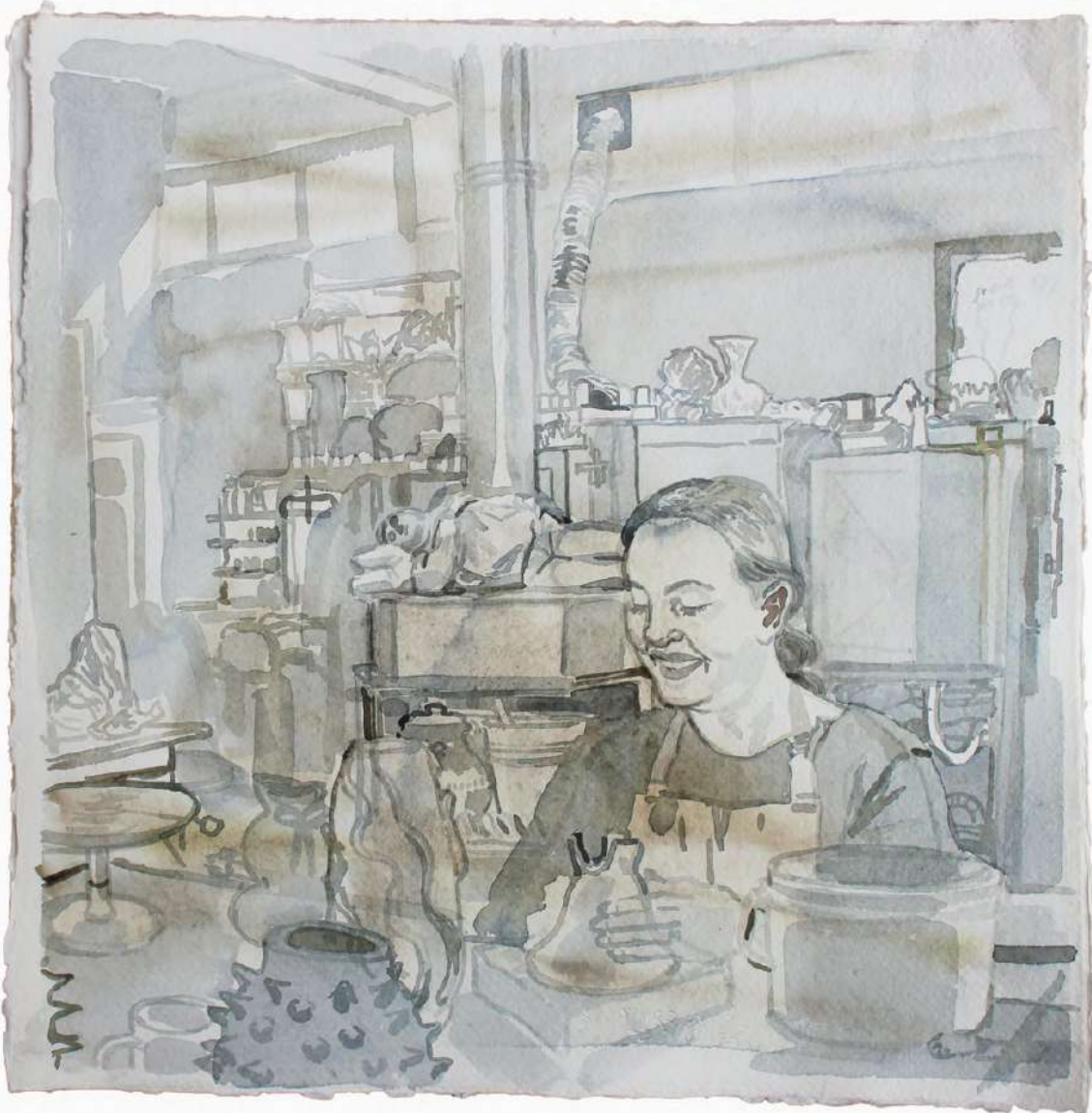
ISABELLA KUIJERS Ceramic Studio 5 , 2024 Watercolour on paper 29.5 x 29.5 cm Framed: 37.3 x 37.3 x 3.5 cm ZAR 12,000