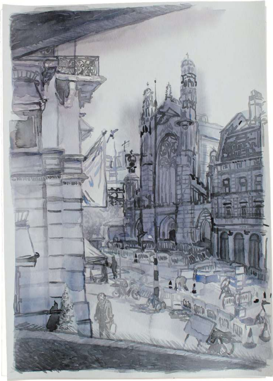
ISABELLA KUIJERS View From The 14 , 2024 Watercolour on paper 41 x 30 cm Framed: 49 x 36.8 x 3.5 cm ZAR 14,000