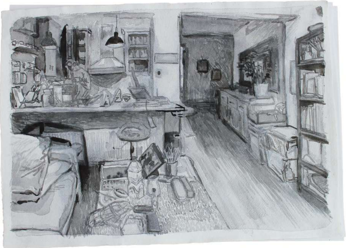
ISABELLA KUIJERS Beginning To Pack , 2024 Watercolour on paper 30 x 41 cm Framed: 36.8 x 49 x 3.5 cm ZAR 14,000