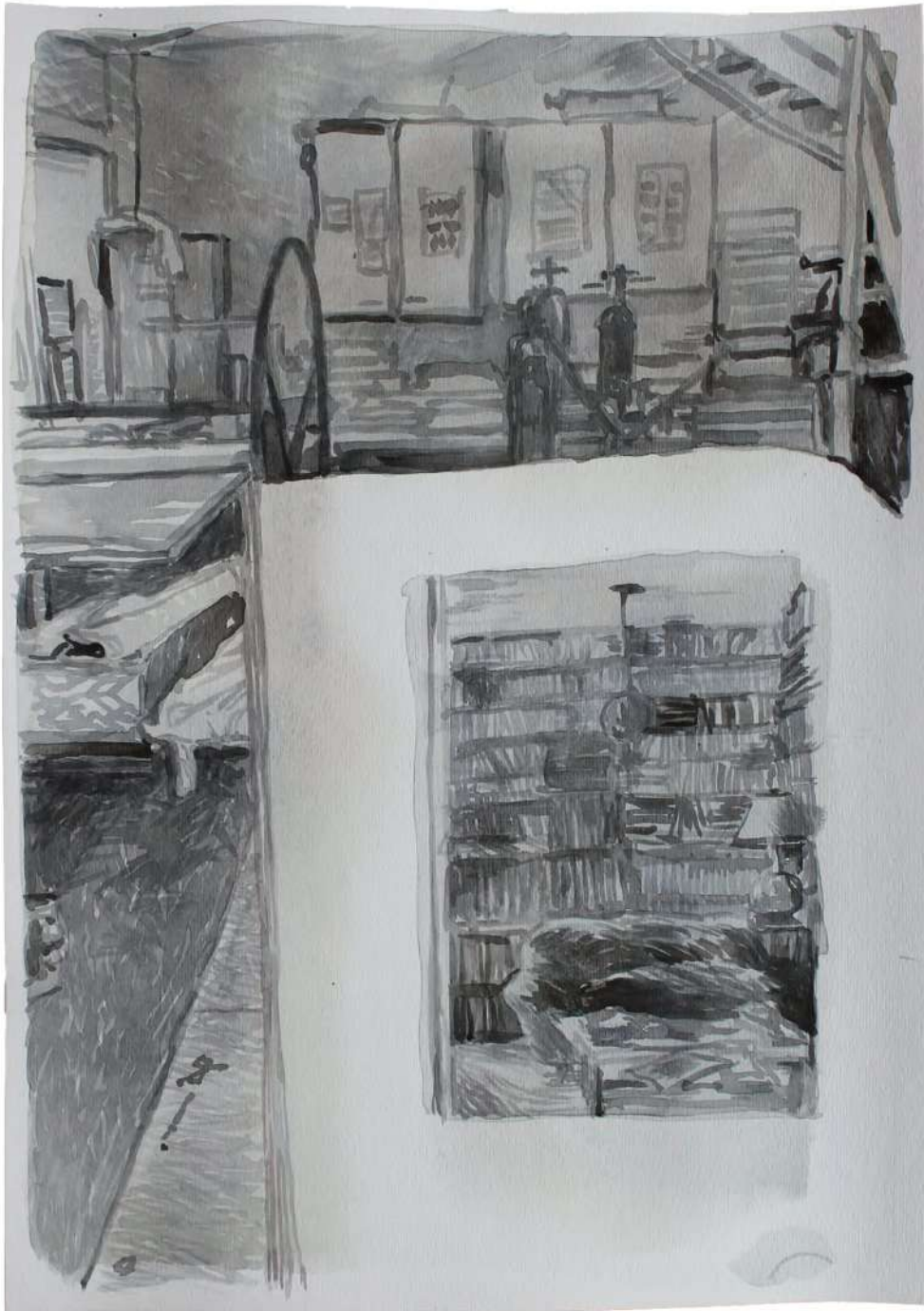
ISABELLA KUIJERS Print Room, Reading Room, 2024 Watercolour on paper 41 x 30 cm Framed: 49 x 36.8 x 3.5 cm ZAR 14,000