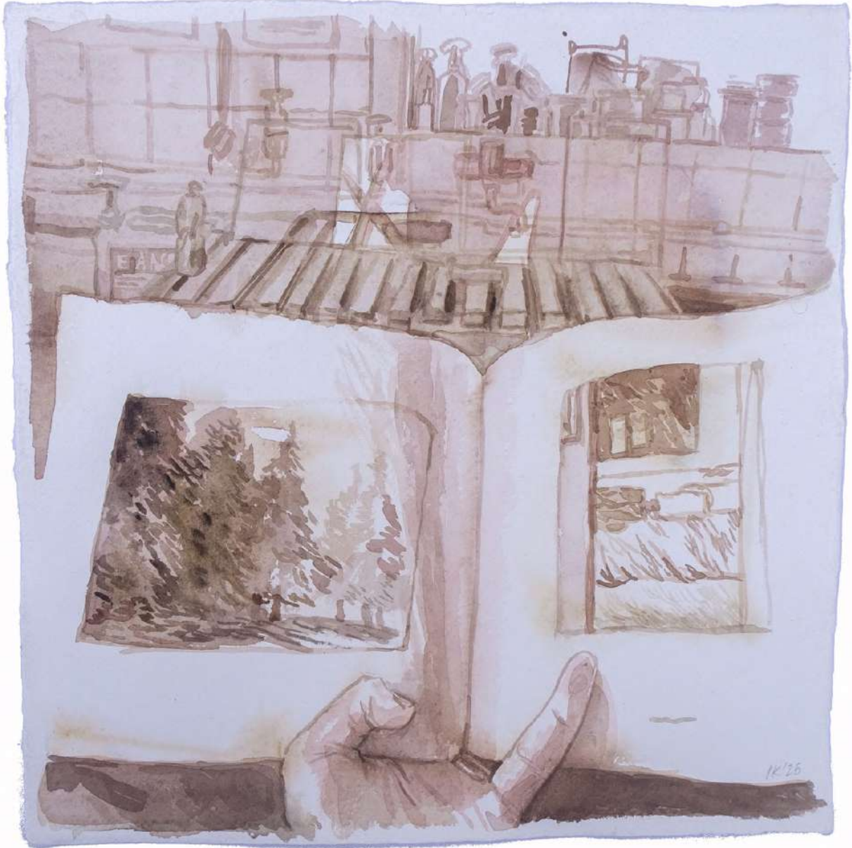
ISABELLA KUIJERS print room, forrest, bed , 2025 Watercolour on paper 30 x 30 cm Framed: 37.5 x 37.5 x 3.5 cm ZAR 12,000