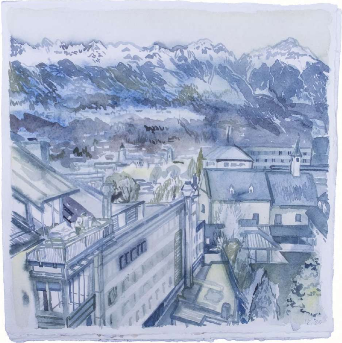
ISABELLA KUIJERS rooftops, austria, 2025 Watercolour on paper 30 x 30 cm Framed: 37.5 x 37.5 x 3.5 cm ZAR 12,000