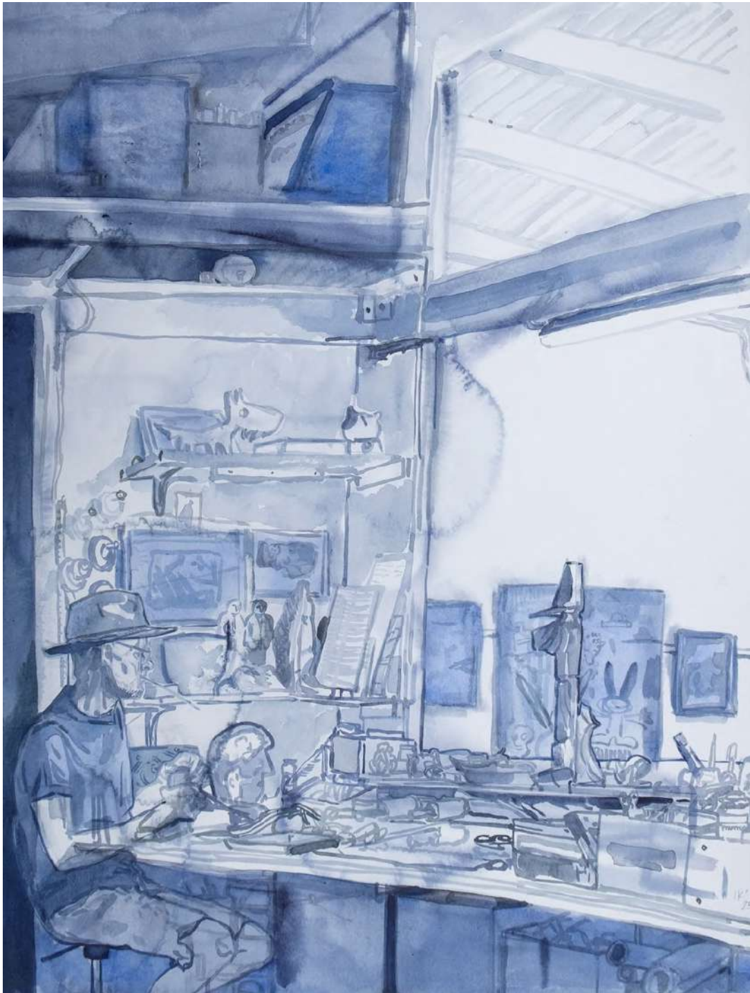
ISABELLA KUIJERS David's studio , 2025 Watercolour on paper 60 x 45 cm Framed: 62.6 x 47.5 x 3.5 cm ZAR 18,000