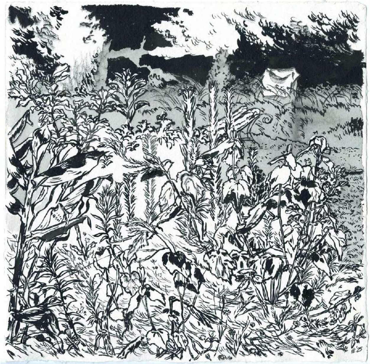
ISABELLA KUIJERS a painters garden, 2025 Ink on paper 30 x 30 cm Framed: 37.5 x 37.5 x 3.5 cm ZAR 12,000