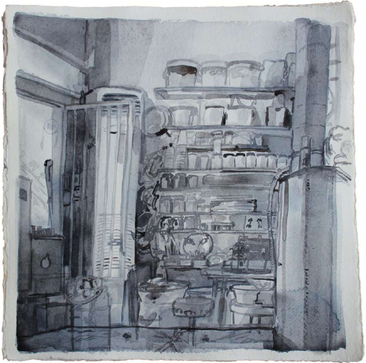
ISABELLA KUIJERS Ceramic Studio 1 , 2024 Watercolour on paper 29.5 x 29.5 cm Framed: 37.3 x 37.3 x 3.5 cm ZAR 12,000