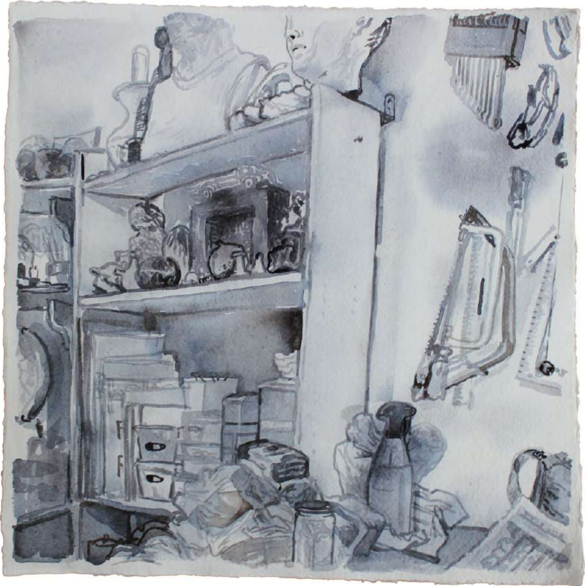
ISABELLA KUIJERS Ceramic Studio 3 , 2024 Watercolour on paper 29.5 x 29.5 cm Framed: 37.3 x 37.3 x 3.5 cm ZAR 12,000