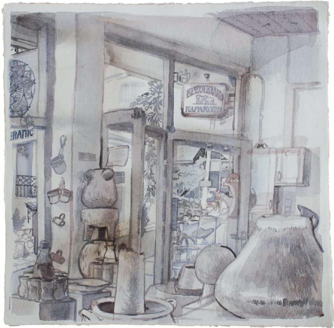
ISABELLA KUIJERS Ceramic Studio 4 , 2024 Watercolour on paper 29.5 x 29.5 cm Framed: 37.3 x 37.3 x 3.5 cm ZAR 12,000