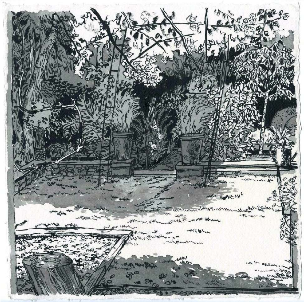
ISABELLA KUIJERS a patch of lawn, 2025 Ink on paper 30 x 30 cm Framed: 37.5 x 37.5 x 3.5 cm ZAR 12,000